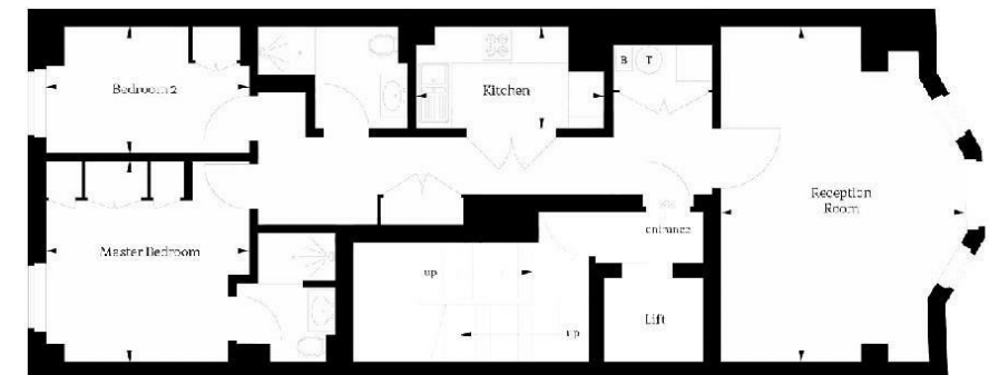
Apartment 3 - Third Floor

IMPORTANT: We would inform prospective purchasers that these sales particulars have been prepared as a general guide only. A detailed survey has not been carried out, nor the services, appliances and fittings tested. Room sizes should not be relied upon for furnishing purposes and are approximate. If floor plans are included, they are for guidance only and illustration purposes only and may not be to scale. If there are any important matters likely to affect your decision to buy, please contact us before viewing the property.